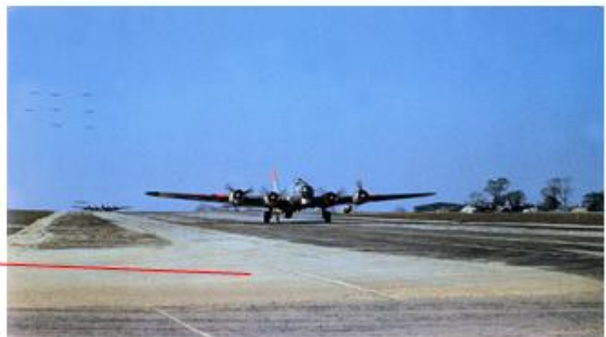
Airfield Main Entrance