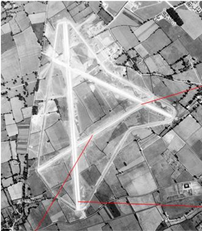
We fly here

The photos and the map show B-17's (Flying Fortress) landing at Eye Airfield and the map shows where they landed in comparison to where we now currently fly.